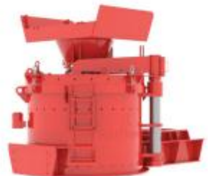
VERTICAL IMPACT CRUSHER IN USE