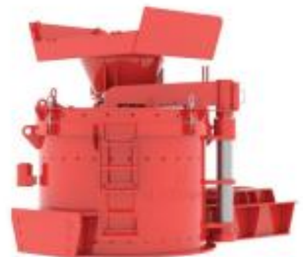
VERTICAL IMPACT CRUSHER IN USE